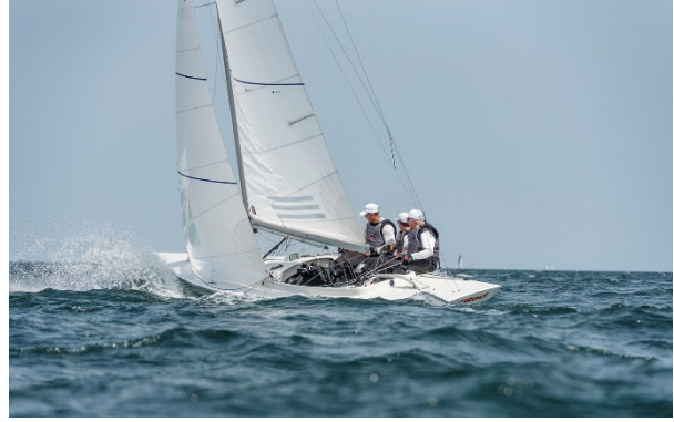
Scenes from the Dragon Class Race