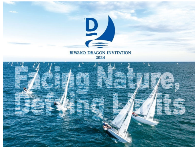
Key visual for "BIWAKO DRAGON INVITATION 2024"

Osaka, Japan (August 29, 2024) - Yanmar Holdings Co., Ltd., Yanmar Corporation, and Yanmar Marine International Asia Co., Ltd. are proud to announce their sponsorship of the Dragon Class International Yacht Race, "BIWAKO DRAGON INVITATION 2024". The event is set to take place from Thursday, November 21, through Sunday, November 24, 2024 at Lake Biwa, Japan.